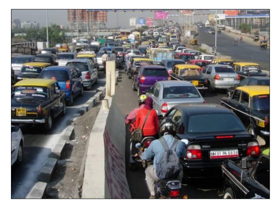
Fig. 2.1: Typical Congestion on Roads (Mahim Causeway)

The observed speeds on some of the major corridors in the study area during 1990 to 2005 indicate that the overall speeds are decreasing with time and the most probable reason is the increasing trend of traffic levels Over a period of fifteen years, minimum average travel speed in Island city has fallen from 18 to 8 kmph , in spite of major capacity expansion programs underway. Maximum average travel speed has shown marginal increase from 25 to 30 kmph, primarily due to construction of flyovers reducing location specific (and movement specific) delays. Most of the network remains, however, highly congested. In the suburbs of Greater Mumbai, Minimum average travel speed has fallen from 30 to 5 kmph, although maximum travel speed increased from 40 to 45 kmph.